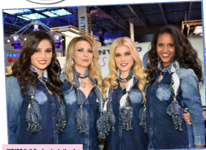
INDIGO Knit Denim steals the show