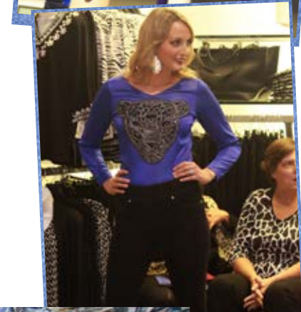
Showstopper INDIGO Knit Denim in Black