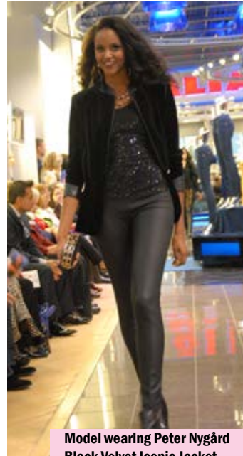
Model wearing Peter Nygård Black Velvet Iconic Jacket