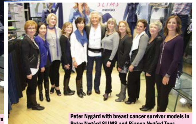
Peter Nygård with breast cancer survivor models in Peter Nygård SLIMS and Bianca Nygård Tops