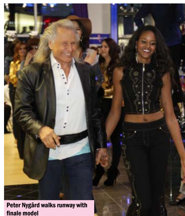
Peter Nygård walks runway with finale model