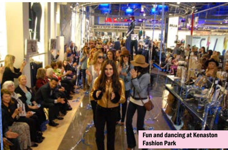
Fun and dancing at Kenaston Fashion Park